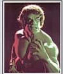
"The Incredible Hulk" Lou Ferrigno

TWO FUN-FILLED DAYS OF FAMILY ENTERTAINMENT!